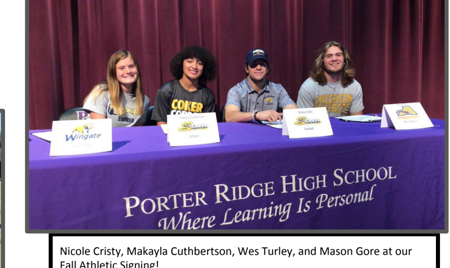
Fall Athletic Signing!