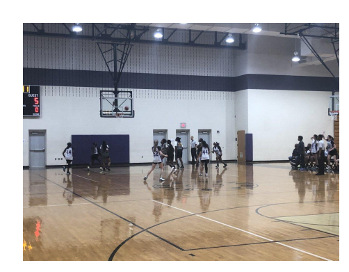
Women's Basketball starts off strong in scrimamages!