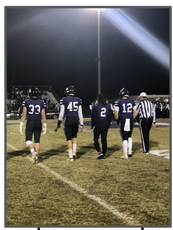
Varsity Football Captains at Senior Night.